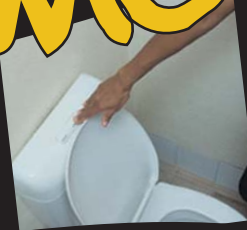
after using the toilet